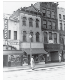
Co-sponsored by the Jewish Study Center

What it was like to live and worship as a Jew between 1850 and 1950 in the historic Seventh St. neighborhood now known as