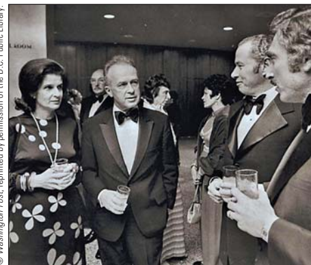
Co-sponsored by the Jewish Primary Day School in coordination with its Third Annual Yitzhak Rabin Memorial Lecture Exhibition created in cooperation with the Embassy of Israel

The exhibition chronicles Prime Minister Rabin's life and work in the nation's capital.